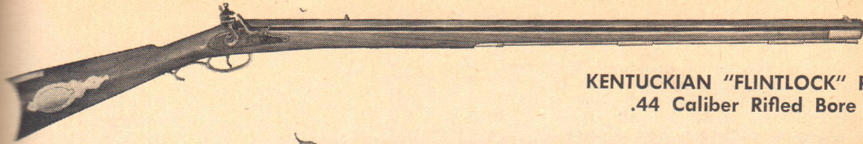
KENTUCKIAN "FLINTLOCK" RIFLE .44 Caliber Rifled Bore