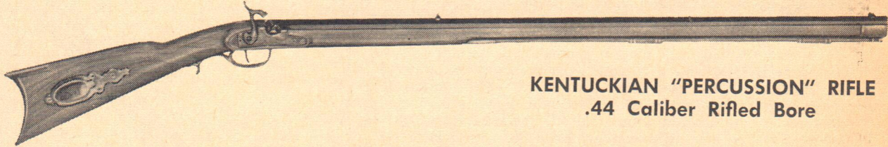
KENTUCKIAN "PERCUSSION" RIFLE .44 Caliber Rifled Bore